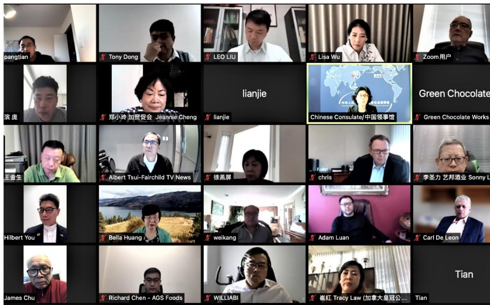
(Video conference screenshots)

On September 23 rd , 2021, the Consulate-general in Vancouver held the “Entering the Fourth CIIE” video conference, a farewell meeting for the twenty-five BC companies ready to go to Shanghai for the expo in November.